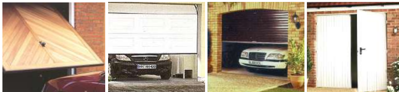
Up and over Sectional Roller Side-hinged

All types supplied, fitted and repaired - Remote Controls Prompt professional service - Quality guaranteed installations