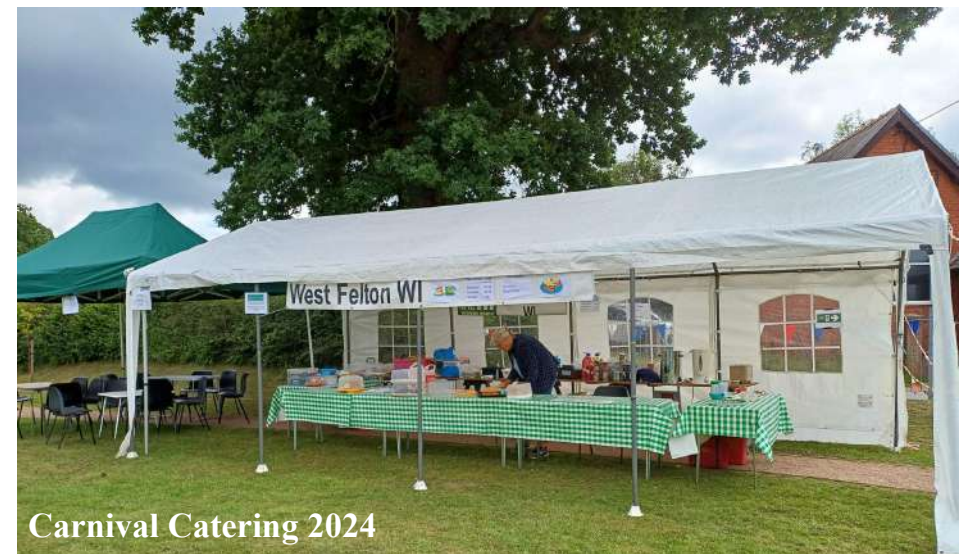
Carnival Catering 2024

This year a new President will appear and will lead WFWI on to greater things for a year or two, or three. She will be supported by the present officers and past Presidents and will steer the group to another fun year for the fifty or so members. They will still sing Jerusalem, and some will make jam in the privacy of their own homes - but who knows what new and exciting events the new committee will come up with? ♦